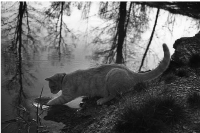
Testing the Water Trudy Roney 1 st Place Winner for 2008